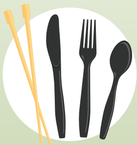
Knives, forks, spoons, chopsticks