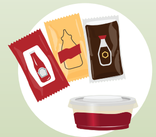
Sauce or condiment packets, sachets, or containers

To request an ADA accommodation, contact Ecology by phone at (360) 742-9874 or email at bagban@ecy.wa.gov , or visit https://ecology.wa.gov/accessibility .